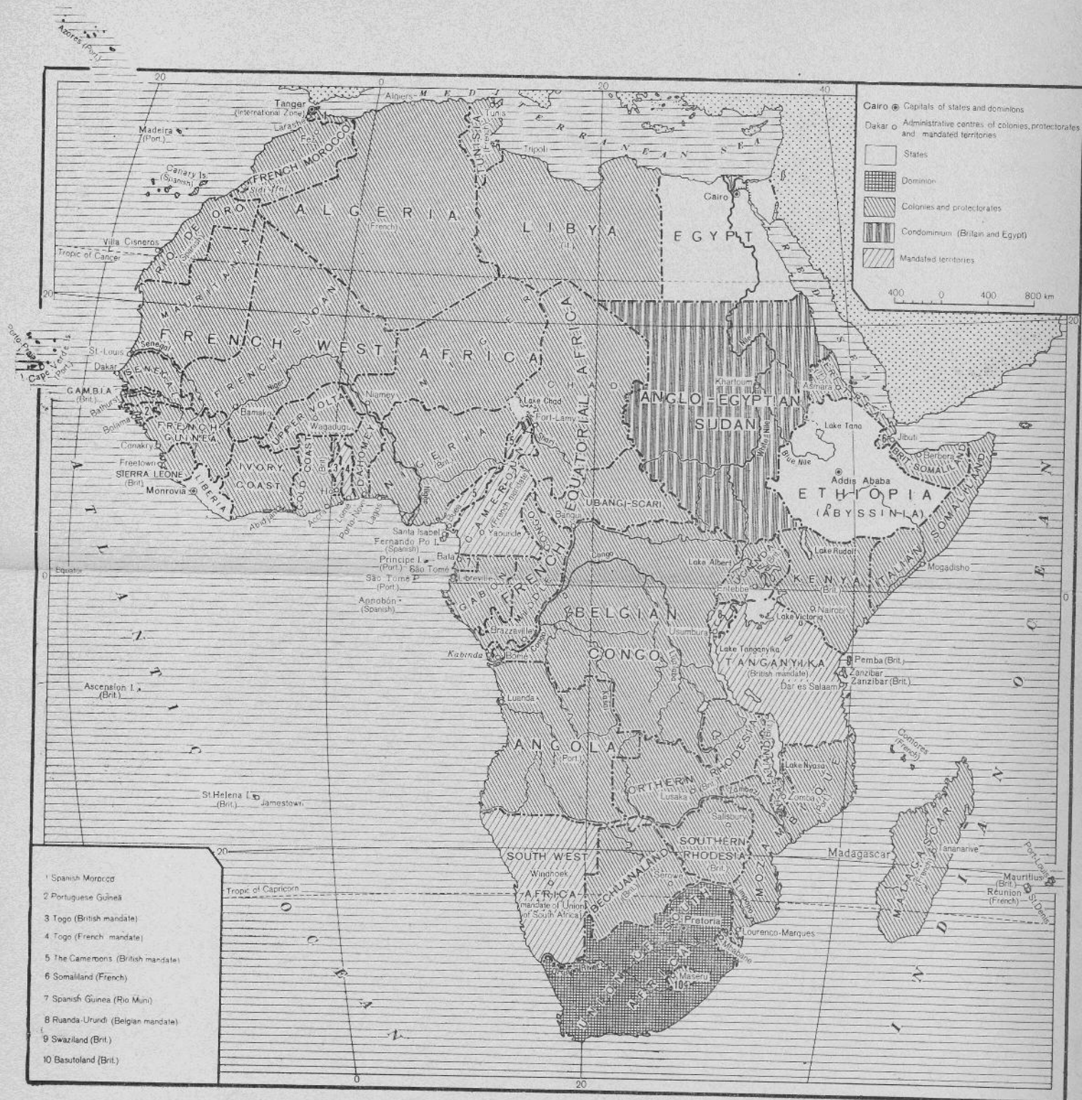
Africa after the First World War